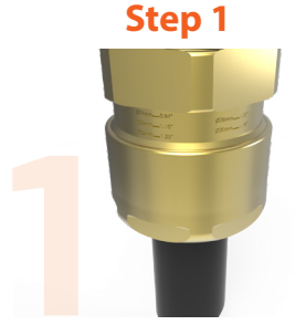
Follow cable gland installation instructions until final stage – tightening of rear seal

The gland is permanently marked with various lines/numbers indicating the correct tightening level related to the cable diameter. Following the relevant cable gland Installation Instructions, the back seal should be tightened until a seal is formed on the cable outer sheath and then tightened one further turn.