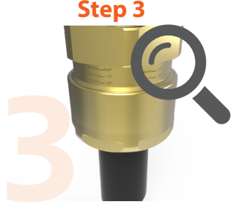
The backnut should be level with the marking guide corresponding to its diameter – this can be visually inspected and adjusted as necessary

Note: The cable gland installation instructions have a printed cable OD measure for if the cable OD is not known